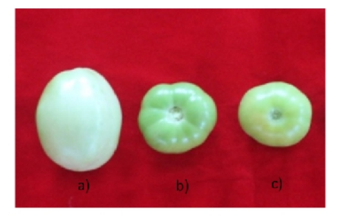
Fig. 2. Variation in immature fruit colour a) Greenish white, b) green, c) light green.

Mature fruit color was red for the fifteen accessions studied, while three gave orange coloured fruits. The results are in accordance with Parisi et al. (2016) who found three colour variations namely orange pink and red in tomato. Two among the studied accessions produced fruits with prominent green shoulders (Fig. 3). This is in line with the reports of Parisi et al. (2016); Sacco et al. (2015) where they emphasized the presence or absence of green shoulder in tomato. Fruit shoulder shape varied from flat, slightly depressed and moderately depressed. Four accessions produced fruits with flat shoulder, whereas, five accessions gave fruits of moderately depressed and nine showed slightly depressed fruit shoulder. These results agreed with the findings of Figas et al. (2014). Similar results were observed by Bhattarai et al. (2018) such as flat, slightly flat, notched, slightly-depressed, moderately-depressed, depressed and strongly-depressed shoulder shape. Fruit cross-sectional shape was categorized into rounded and irregular shape in the study. All accessions produced