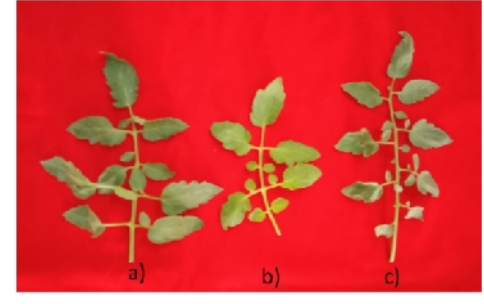
Fig. 1. Variation in leaf type observed a) potato, b) standard, c) peruvianum.

Mature fruit color was red for the fifteen accessions studied, while three gave orange coloured fruits. The results are in accordance with Parisi et al. (2016) who found three colour variations namely orange pink and red in tomato. Two among the studied accessions produced fruits with prominent green shoulders (Fig. 3). This is in line with the reports of Parisi et al. (2016); Sacco et al. (2015) where they emphasized the presence or absence of green shoulder in tomato. Fruit shoulder shape varied from flat, slightly depressed and moderately depressed. Four accessions produced fruits with flat shoulder, whereas, five accessions gave fruits of moderately depressed and nine showed slightly depressed fruit shoulder. These results agreed with the findings of Figas et al. (2014). Similar results were observed by Bhattarai et al. (2018) such as flat, slightly flat, notched, slightly-depressed, moderately-depressed, depressed and strongly-depressed shoulder shape. Fruit cross-sectional shape was categorized into rounded and irregular shape in the study. All accessions produced